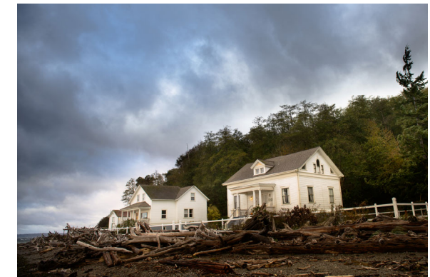
Point Robinson Light Station

Island residents receive a 20% discount during Low Season. Must book directly with Vashon Park District by emailing lodgings@vashonparks.org or calling our office at: (206) 463-9602